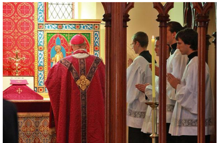
The Bi-centenary Mass