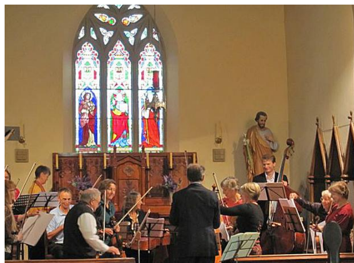
The Hobart Chamber Orchestra in concert in St John's Church, Richmond