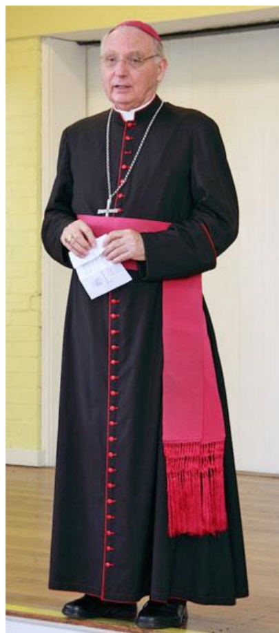
Bishop Jarrett launches the Bi-centenary Organ Appeal in the Colebrook village hall