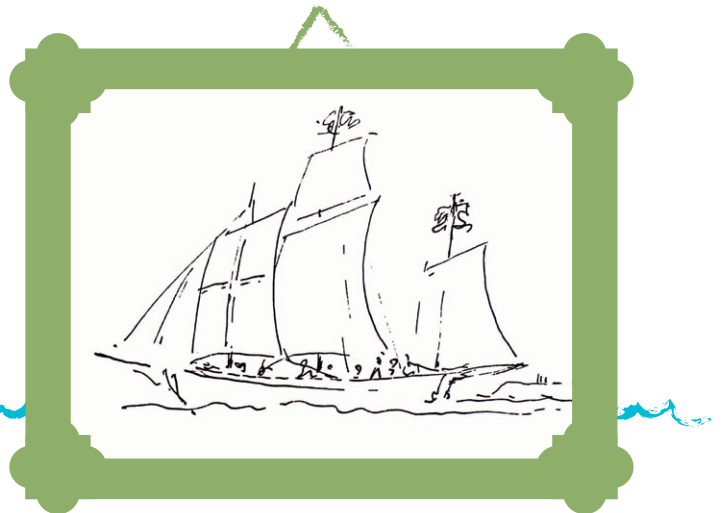
A drawing by Pugin of his own boat in a letter to a friend

He would summon the crew of Caroline and rescue boats and their sailors when they were in danger.